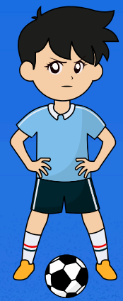
Florin Velea Reception - Year 4

Each term we will be looking at a different category of sports. This term we will be looking at striking and fielding sports with a particular focus on cricket. Students will learn the fundamental basics of cricket such as throwing and catching before applying these learnt skills in modified games with their peers. As well as learning skills, the students will also learn the rules and scoring system of cricket. Students will be provided the opportunity to demonstrate their understanding in an end of term cricket assessment quiz that will form part of their grade.